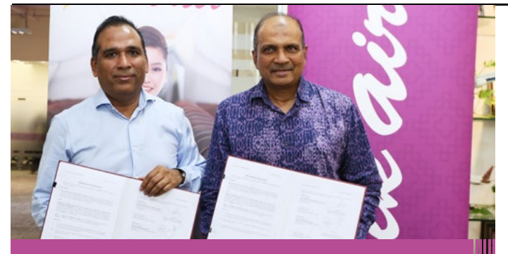
Malaysia Healthcare Travel Council Partners Batik Air Malaysia to Enhance Medical Tourism

Among the key customer-centric features is My Journey, which blends flight tracking with inflight entertainment For more information, visit www.cathaypacific.com by incorporating real-time flight paths and map layers