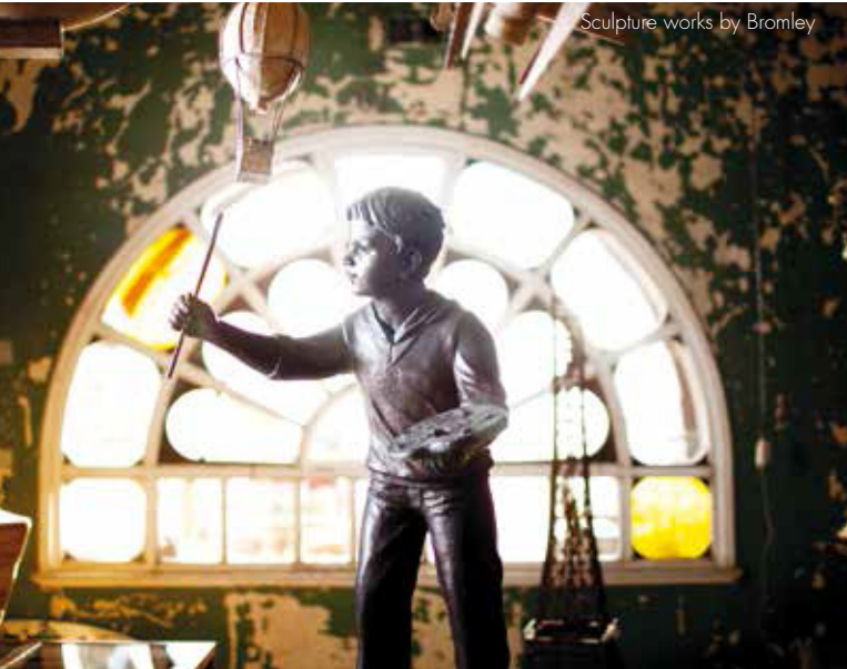
Sculpture works by Bromley