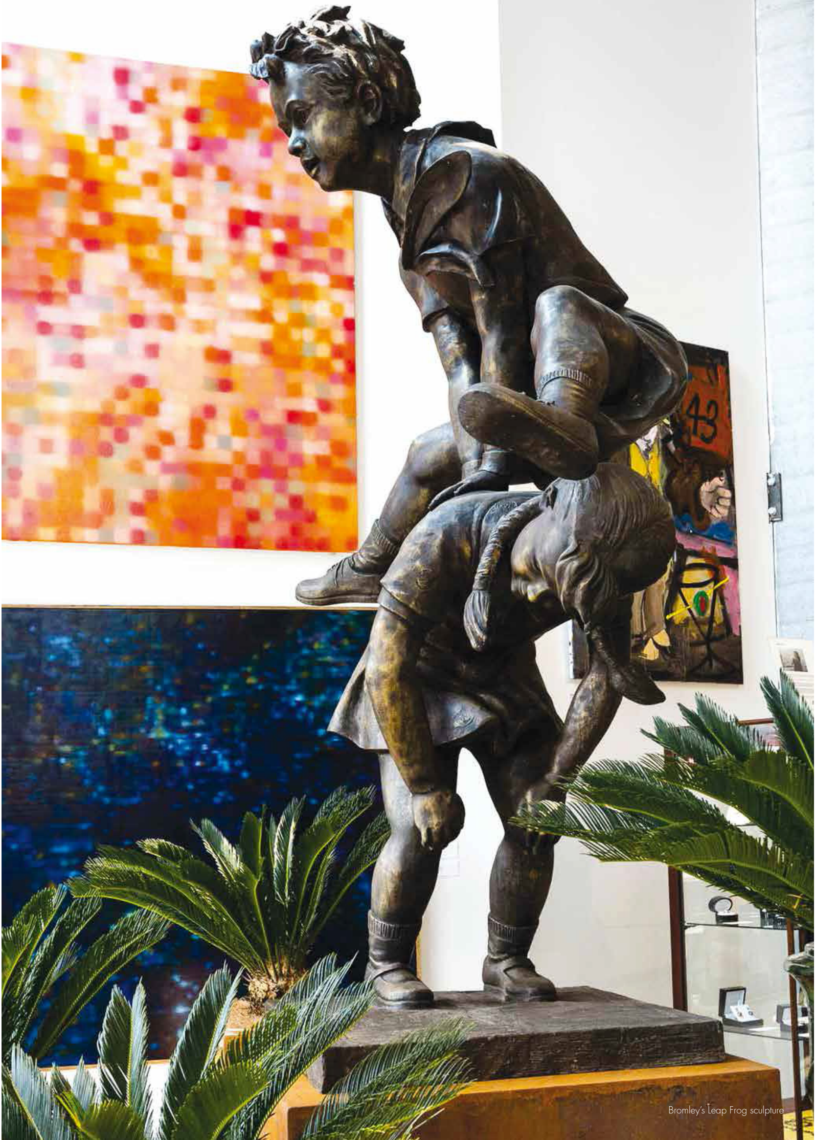
Bromley's Leap Frog sculpture

David Bromley has collaborated with countless product brands, celebrities, fashion lines, and of course galleries, producing fine works that add vigour to his portfolio. The world is no stranger to Bromley’s art. His works have hung on walls and graced the rooms of esteemed galleries, from LA to Singapore and all the way to Xia Men, China.