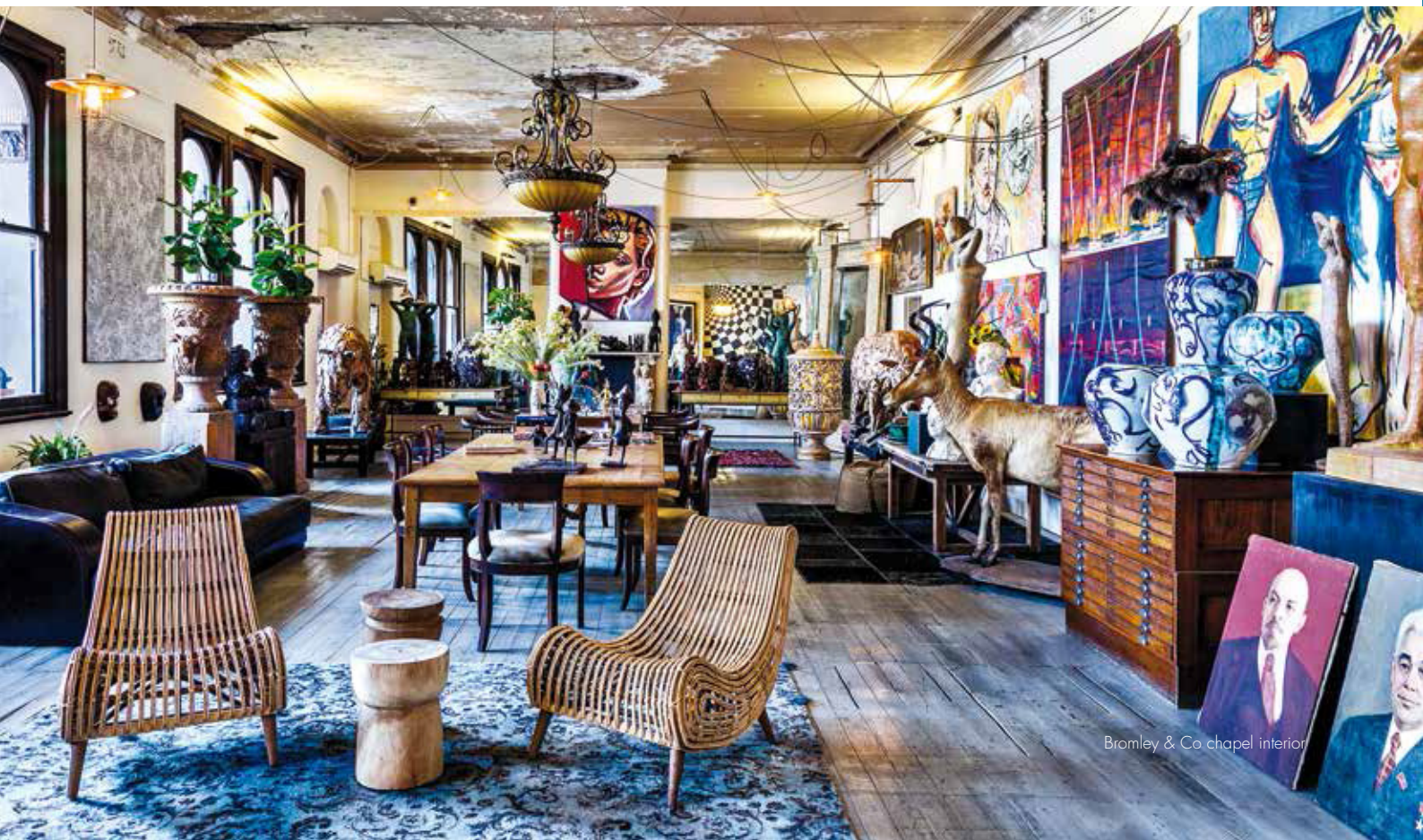
Bromley & Co chapel interior

“At 56, I am young and have a determination to grow, to seek, to challenge,” he added.