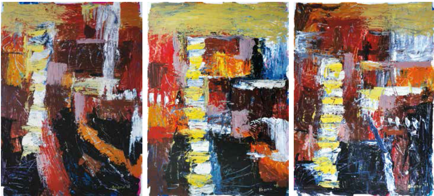
Abstract Landscape V, 2011 Oil on paper 54.5 x 67 cm x 3 pieces SOLD RM 7,150.00 KLAS Art Auction 7 July 2013 Edition IV