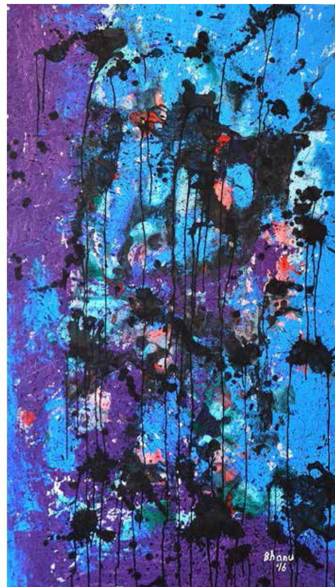
Forest Impression, 2016 Oil on canvas 152.5 x 88 cm SOLD RM 5,072.40 KLAS Art Auction 12 March 2017 Edition XXVI