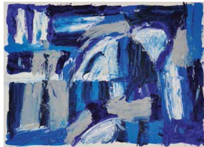
Abstract Landscape, 2011 Abstract Landscape 2, 2009 Oil on paper 55 x 60.5 cm SOLD RM 4,400.00 KLAS Art Auction 19 January 2014 Edition VII